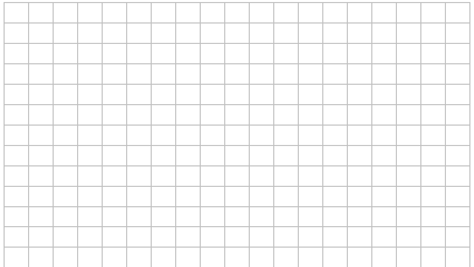
Sign Sketch Area