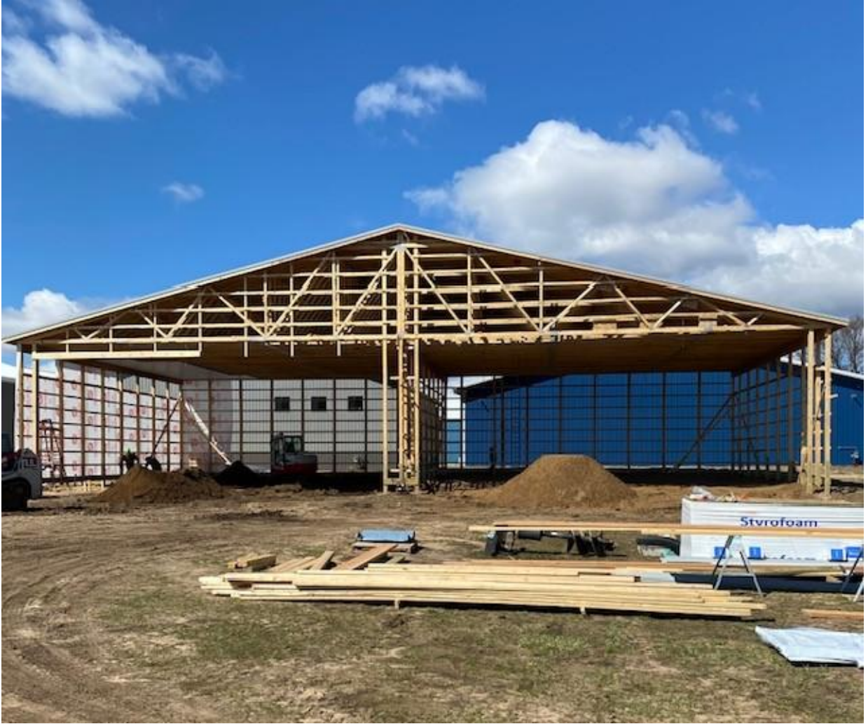
Gilchrist hangar project taking shape.